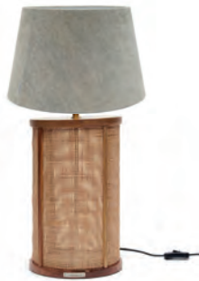
Ibiza Webbing Lamp