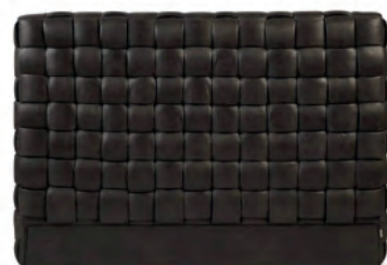
Room 48 Headboard