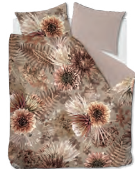
Protea Sand 100% cotton.