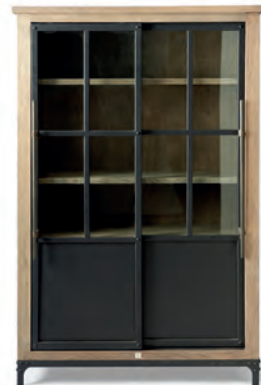
Buffet Cabinet The Hoxton