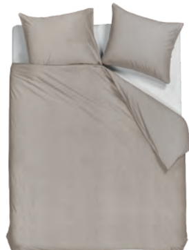
Cecelia Sand. Front: 100% polyester velvet, back: 100% cotton.