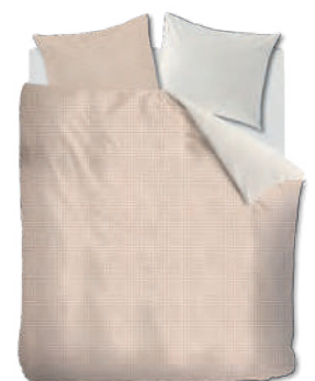
Eleanor Sand 100% cotton flannel.