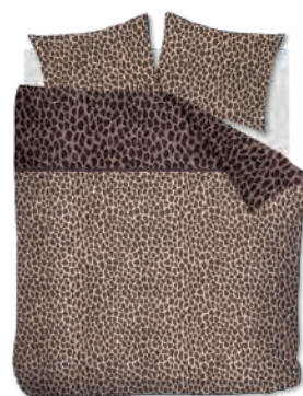
Cheetah Brown 100% cotton.