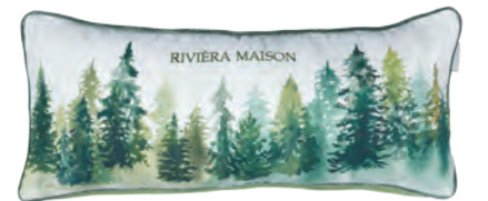
Picea Green Cushion