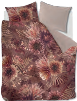
Protea Terra 100% cotton.