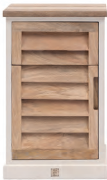
Bed Cabinet Pacifica