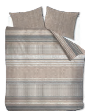
Twill Weave Brown 100% cotton.