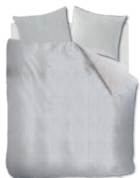
Eleanor Grey 100% cotton flannel.