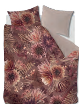
Protea Terra 100% cotton.