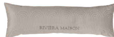
Cecelia Cushion Sand. 100% polyester velvet. With embroidery.