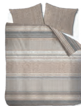
Twill Weave Brown 100% cotton.