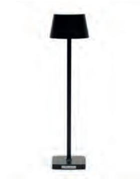
Table lamp Luminee USB Black