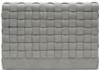
Room 48 Headboard, mouliné linen, fabulous flax