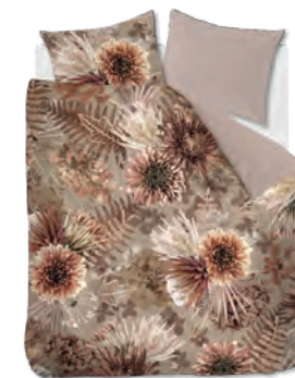
Protea Sand 100% cotton.