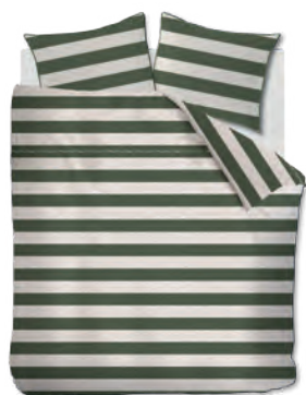
Brayden Green 100% cotton.