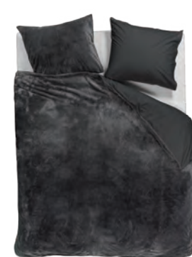
Tendre Grey. Front: 100% polyester velvet, back: 100% cotton.