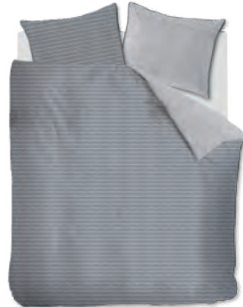
Pinstripe Grey 100% cotton.