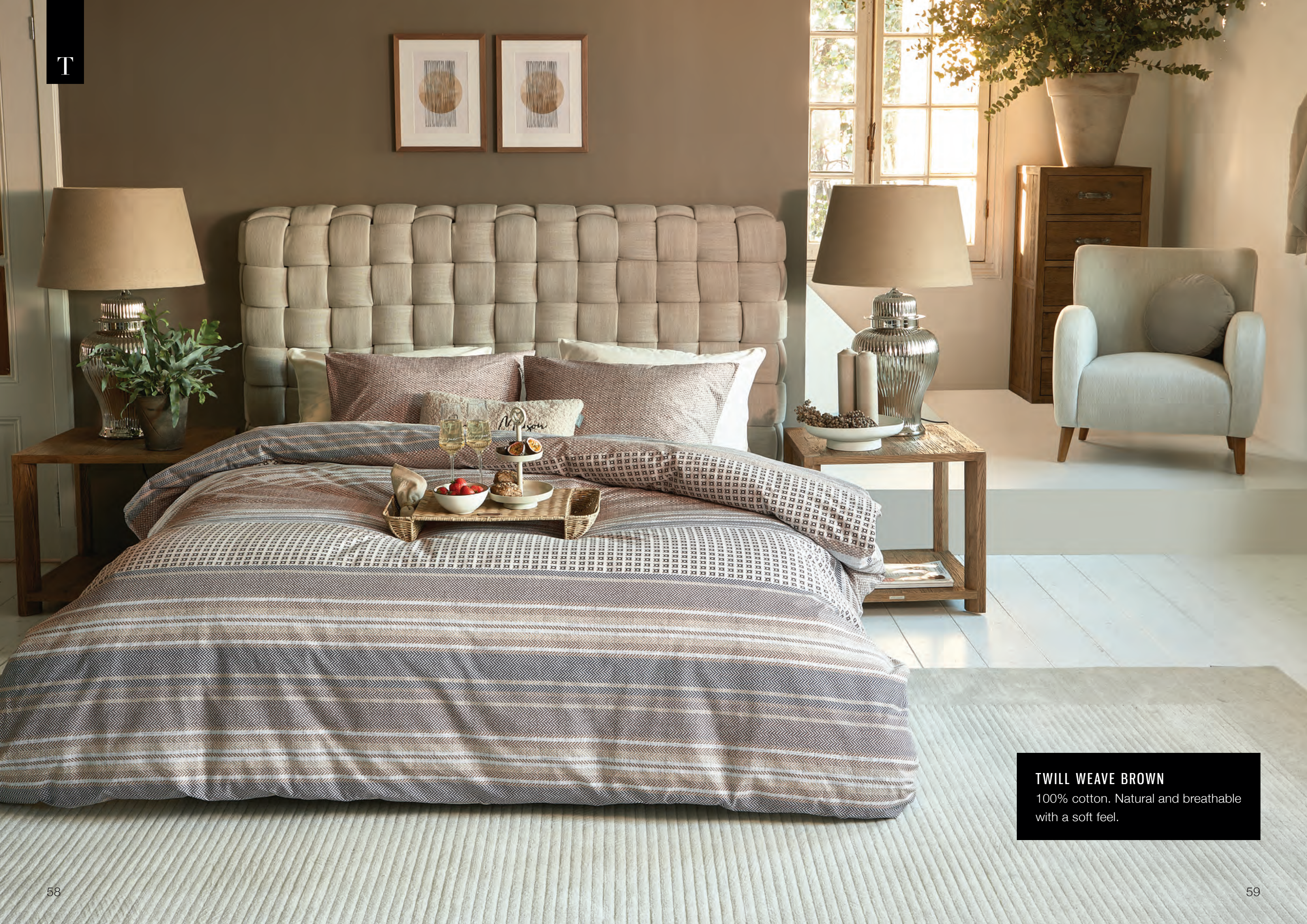
TWILL WEAVE BROWN 100% cotton. Natural and breathable with a soft feel.