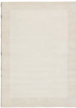
Rug Tulo Carpet