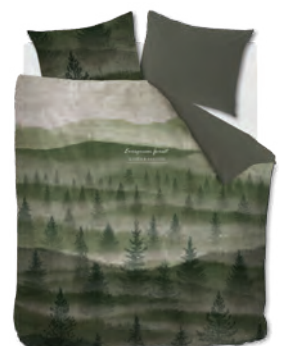
Evergreen Green 100% cotton.