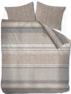
Twill Weave Brown