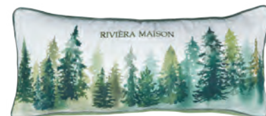
Picea Cushion Green. 100% cotton slub. With piping.