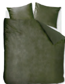
Estate Olive Green. Front: 100% polyester velvet, back: 100% cotton.