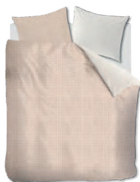
Eleanor Sand 100% cotton flannel.