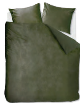
Estate Olive Green