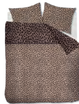
Cheetah Brown 100% cotton.