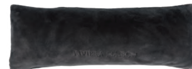
Tendre Cushion Grey. 100% polyester. With embroidery.