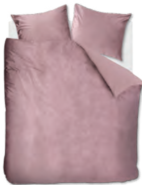
Estate Dark Pink