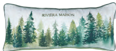
Picea Green Cushion