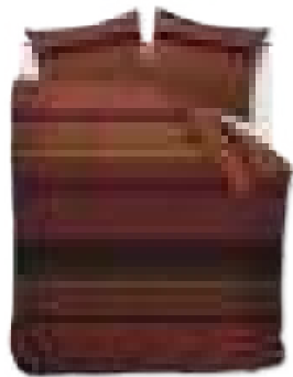
Runway Red 100% cotton satin