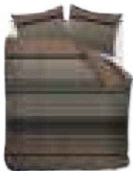
Runway Grey 100% cotton satin