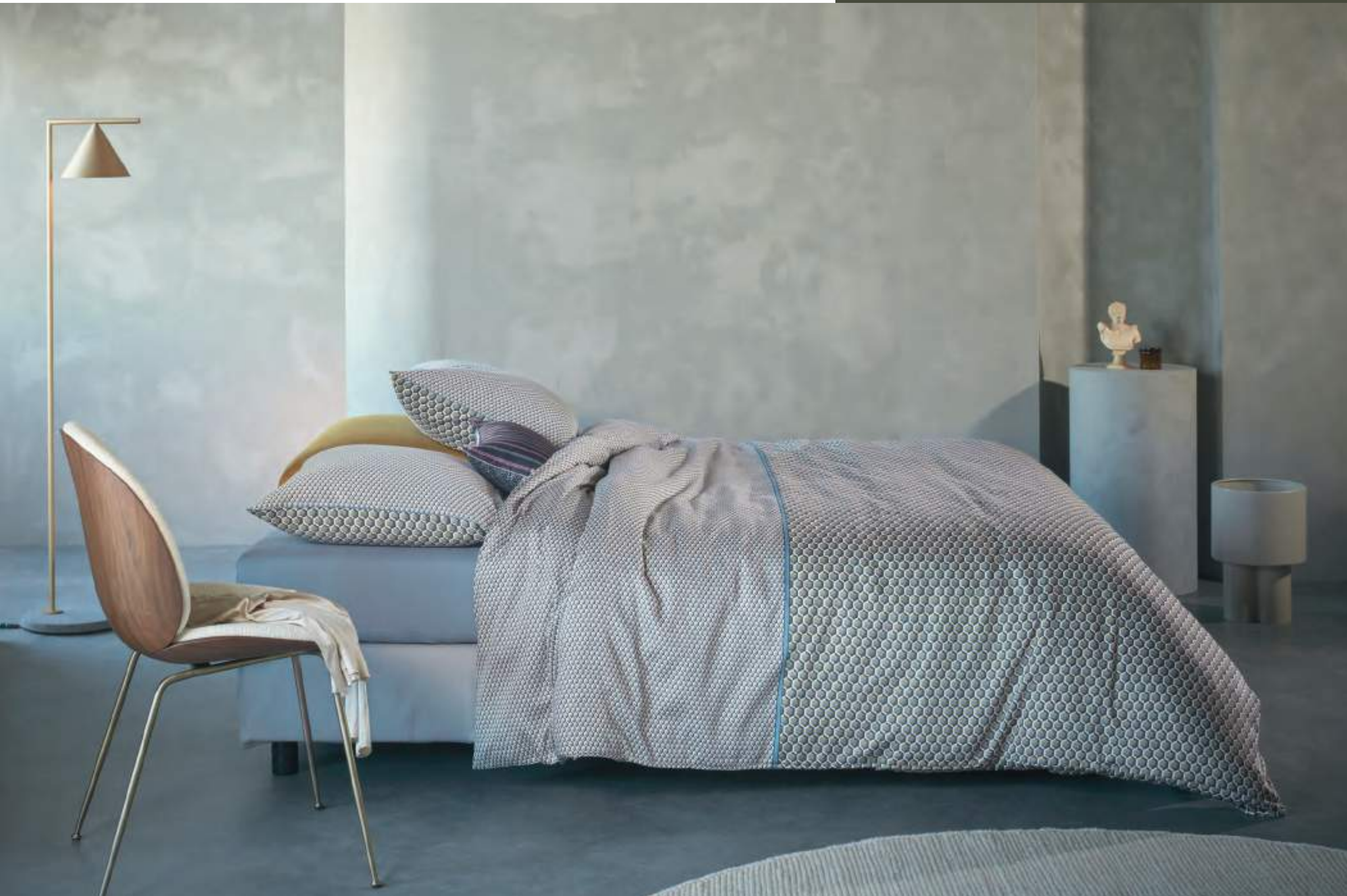
Facette Blue Green 100% cotton satin