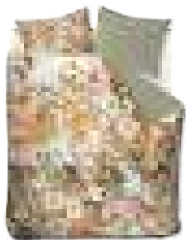
Monarch Olive Green 100% cotton satin With uni dyed backside