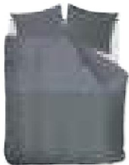
Facette Blue Green 100% cotton satin