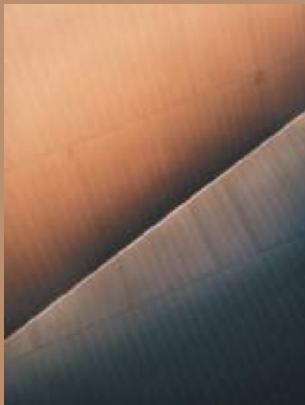
Runway Grey 100% cotton satin