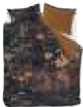
Imperial Brown 100% cotton satin With uni dyed backside