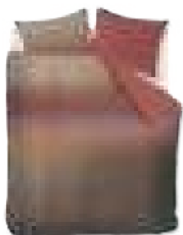
Chronology Multi 100% cotton satin With uni dyed backside