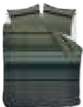
Runway Green 100% cotton satin