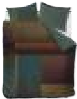
Sloane Square Green 100% cotton satin With uni dyed backside