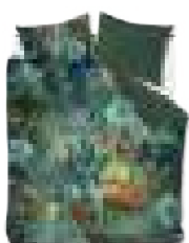
Floral Embrace Blue Green 100% cotton satin With uni dyed backside