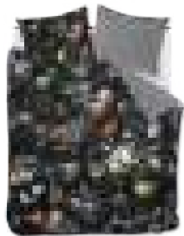
Aureum Multi 100% cotton satin With uni dyed backside