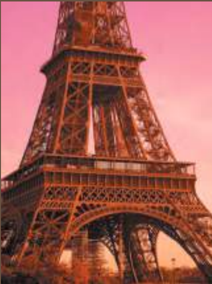
Chronology Multi 100% cotton satin With uni dyed backside

Styled with KAAT Amsterdam Mandarin Purple